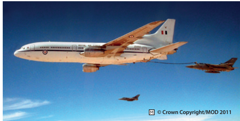
A Royal Air Force TriStar Refuels two Tornado F3s during operations in the Middle East.