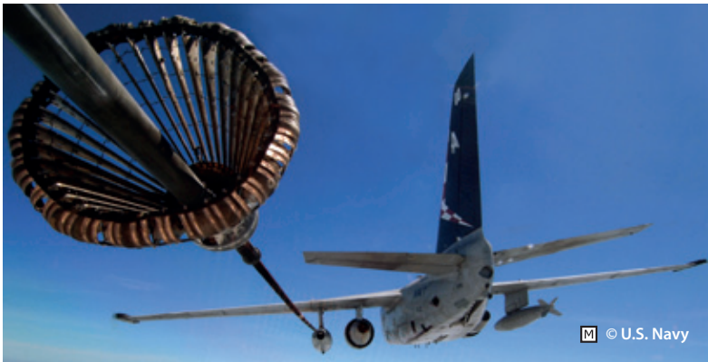
A S-3B Viking refuels another S-3B.