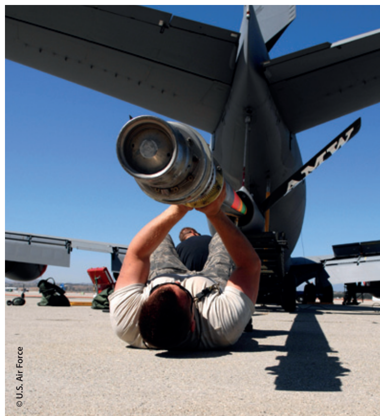
A U.S. Air Force Airman lifts the boom of a U.S. Air Force KC-135 Stratotanker. Reliability rate improvement and turn time reduction are measures to increase existing tankers' efficiency.

3.3.3 Improve Reliability Rates. The cost-benefit ratio of increased investment-improved reliability, and the optimum package of maintenance resources, is dependent on many factors, such as manning, geography, economics, age of the fleet and so on. This involves engineering, modifying, or reengineering aircraft components, and/or providing more robust maintenance capacity, including spare parts, at operating locations.