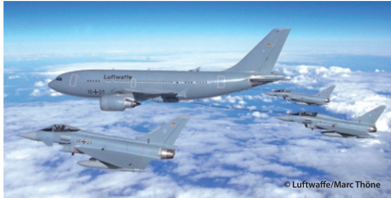
Luftwaffe A-310 MRTT refuelling EF-2000 Eurofighters.