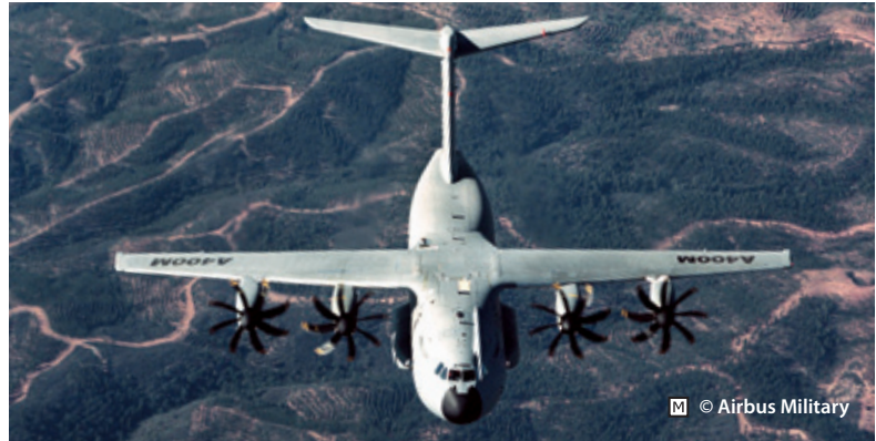
A400M, one of the next generation tankers.

These NATO Nations had ordered the AAR version of the A400M (The number of AAR kits for each Nation is listed; some of these have Hose Drum Units, others pods, or in some cases both)