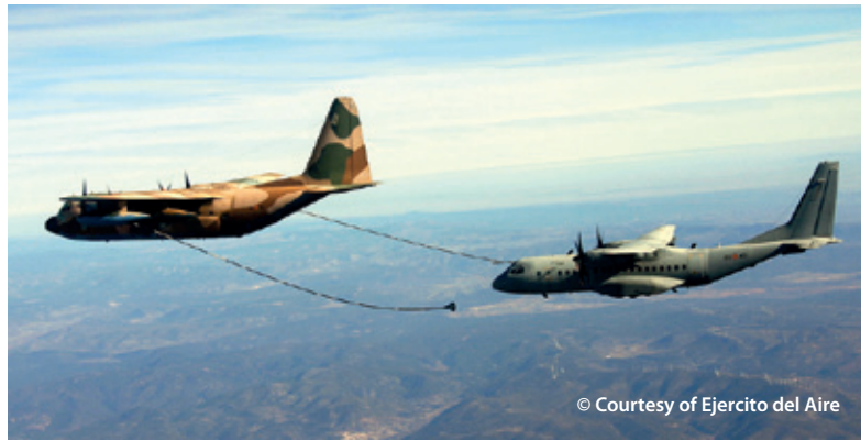
Spanish C-295 in pre-contact position to refuel from a KC-130.

as of April 2010, the US KC-130 recapitalisation program was changing T models into J models.