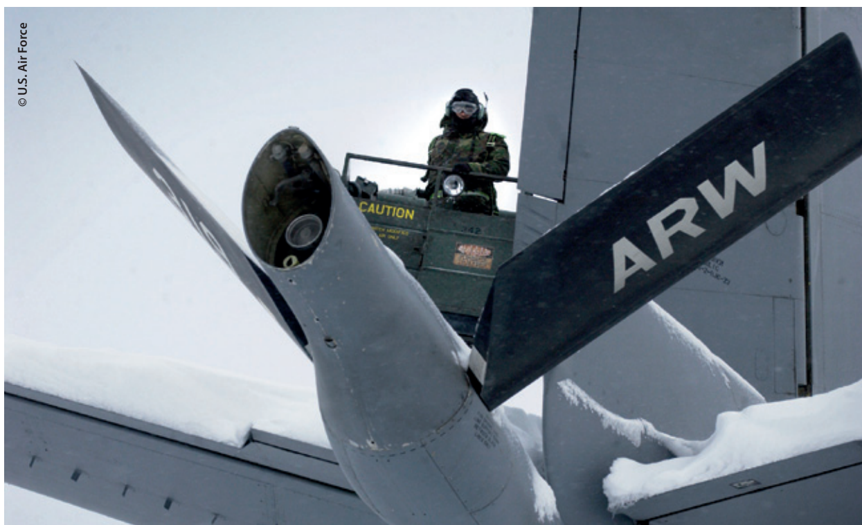
Fuel nozzle visible inside a KC-135 flyable boom.

2.8 Drogue Tunnel/Serving Carriage Lights. The drogue tunnel or the serving carriage of most tanker AAR installations is lit from within. This is particularly useful for gauging the amount of hose pushed back onto the hose drum.