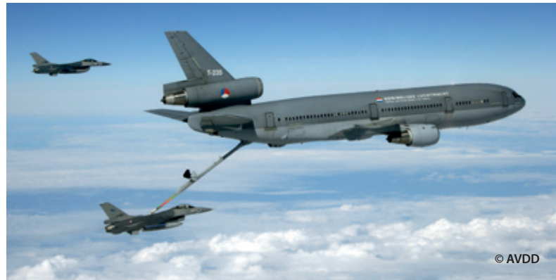
RNLAF KDC-10 refuelling F-16s.