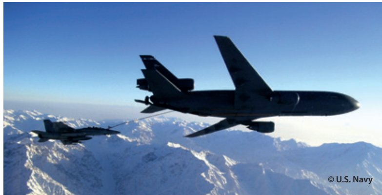
USAF KC-10 refuelling a Hornet over Afghanistan.