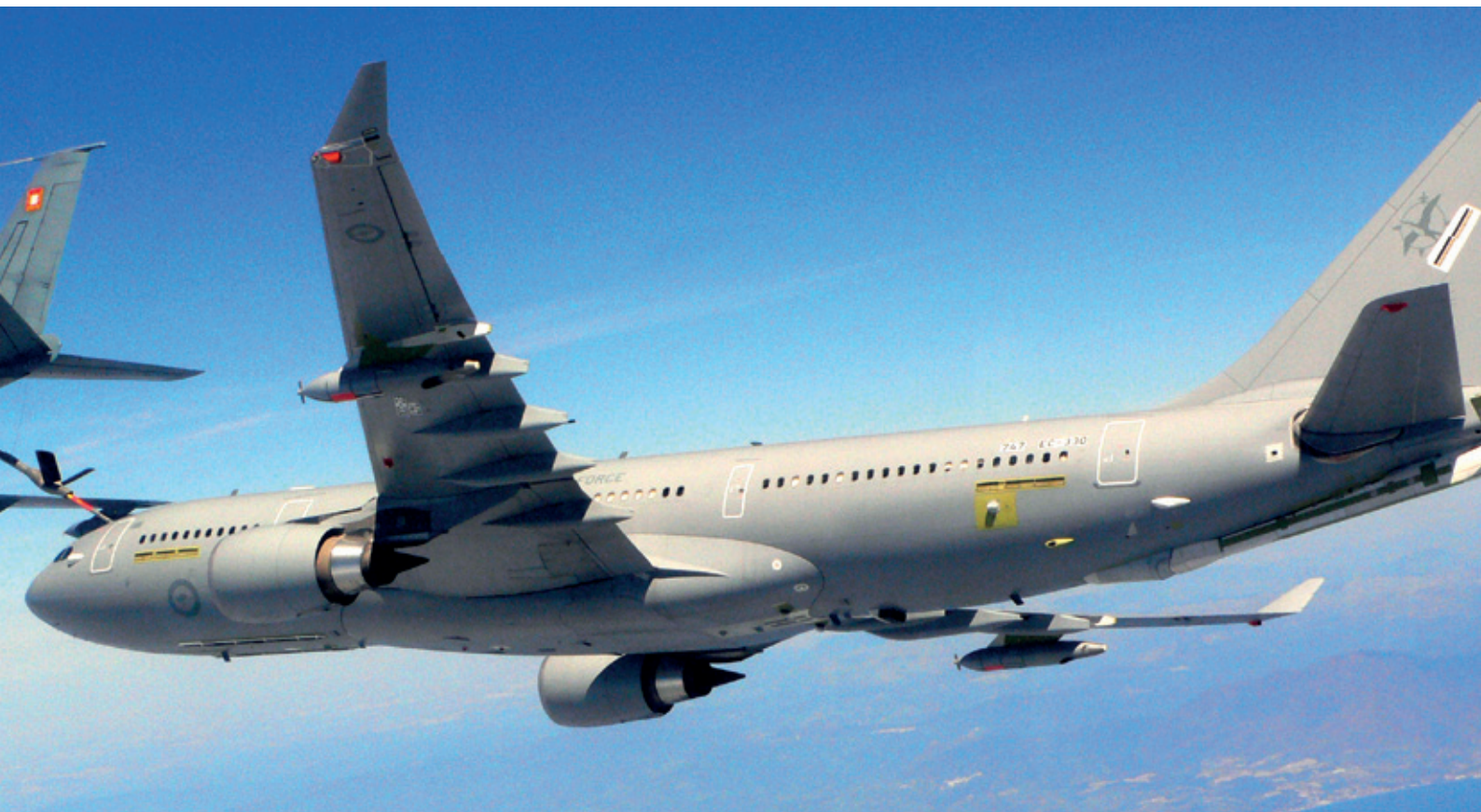
A French C-135 refuels a Royal Australian Air Force A330 MRTT Aircraft (KC-30A). The Fuel Consolidation concept enhances flexibility.

5.5.1 Current NATO planning includes provisions for forward basing within the borders of Alliance Nations. The number of bed-down spots are calculated based on planning scenarios, and operational concepts. Pri-