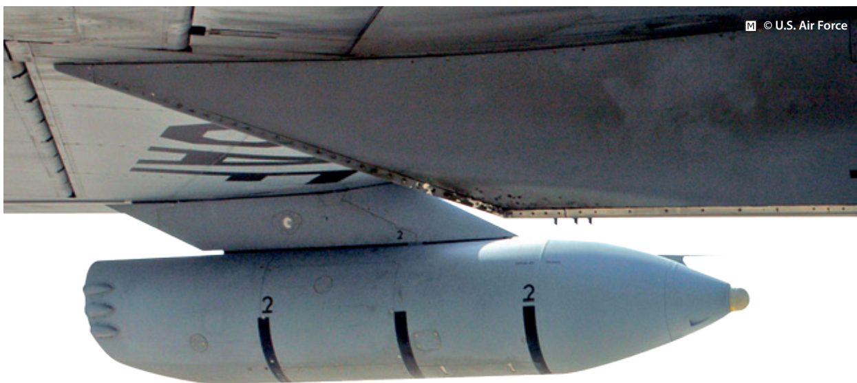
Self-contained AAR drogue pod installed in a KC-135 wing.

Integral AAR systems may be carried on large tankers; normally these are installed within the main fuselage and the hose is trailed from a centreline fairing or tunnel. However, there are variations on this general principle; for example the FAF Transall AAR equipment is mounted within the left-hand fuselage under-carriage bay. Integral AAR systems use a variety of high powered aircraft supplies (pneumatic, hydraulic and electric) for fuel pumping and hose drum drive.