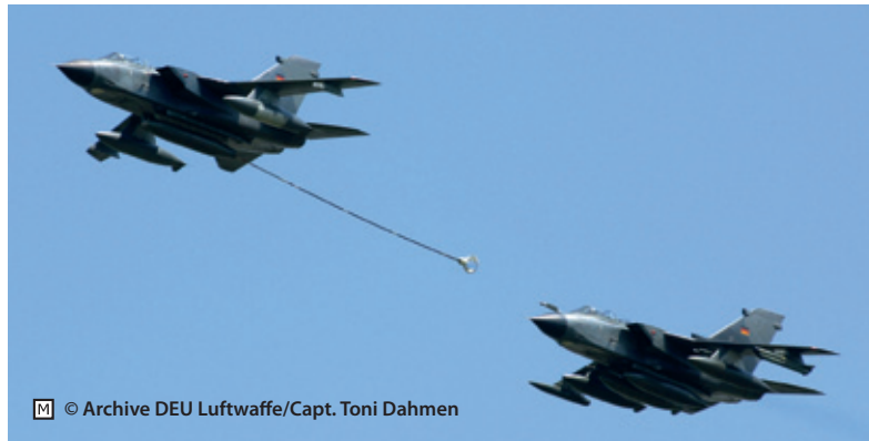
Luftwaffe PA 200 Tornados preparing for buddy-buddy air refuelling.