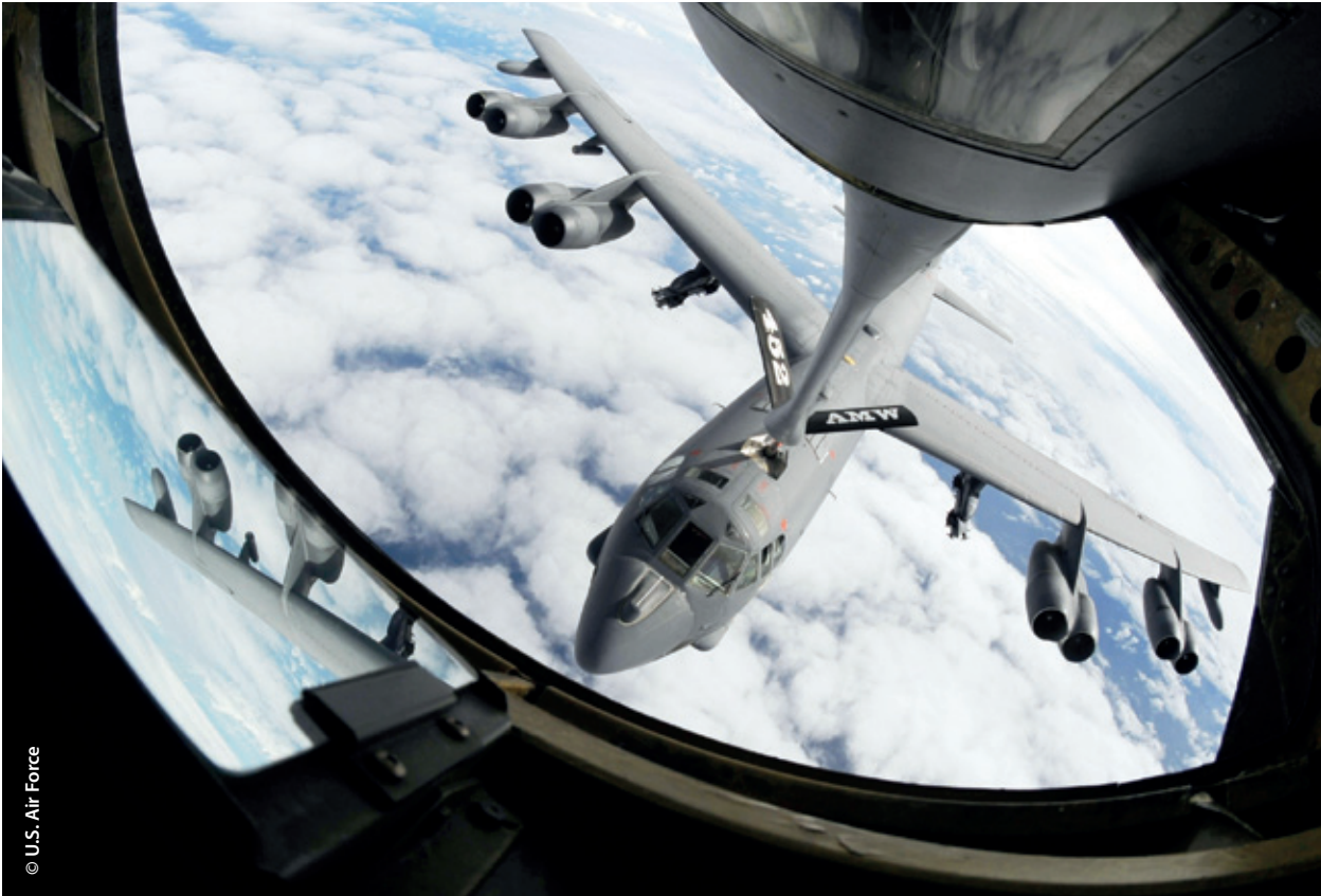
A KC-135 refuels a B-52 Stratofortress, extending the receiver's own capabilities.