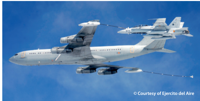
Spanish B-707 refuelling a EF-18 Hornet.