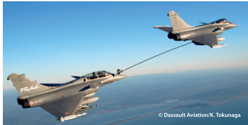
Two French Rafales making buddy-buddy refuelling.