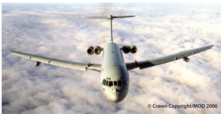
VC 10 K.