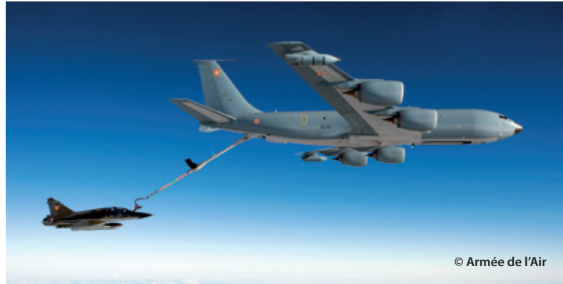
French C-135FR refuelling M-2000.