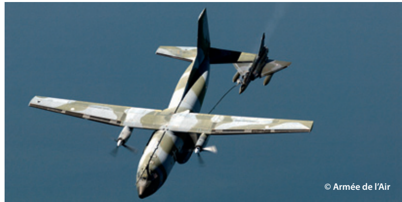
French C-160 refuelling a M-2000.