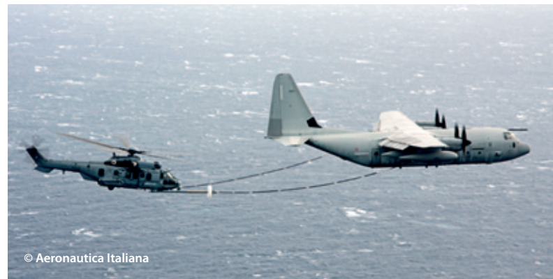
Italian KC-130J refuelling a French EC725 Caracal.

as of April 10, US Marine KC-130 recapitalisation program goal is 79 KC-130Js.