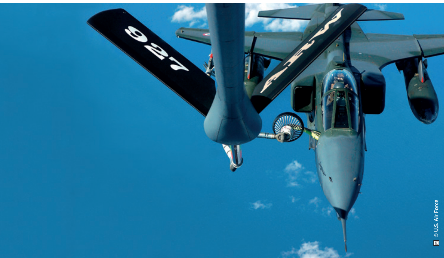
A French Jaguar refuelling from a US KC-135 tanker fitted with Boom Drogue Adapter (BDA).

The KC-135 and the C135FR boom can be modified to refuel some types of probe equipped aircraft by fitting a Boom Drogue Adapter; this consists of 3 m (9 ft) of hose attached to the end of the telescoping part of the boom. The hose terminates in a hard non-collapsible drogue. The BDA can only be fitted/removed on the ground. The PDLs should not be used with this system.