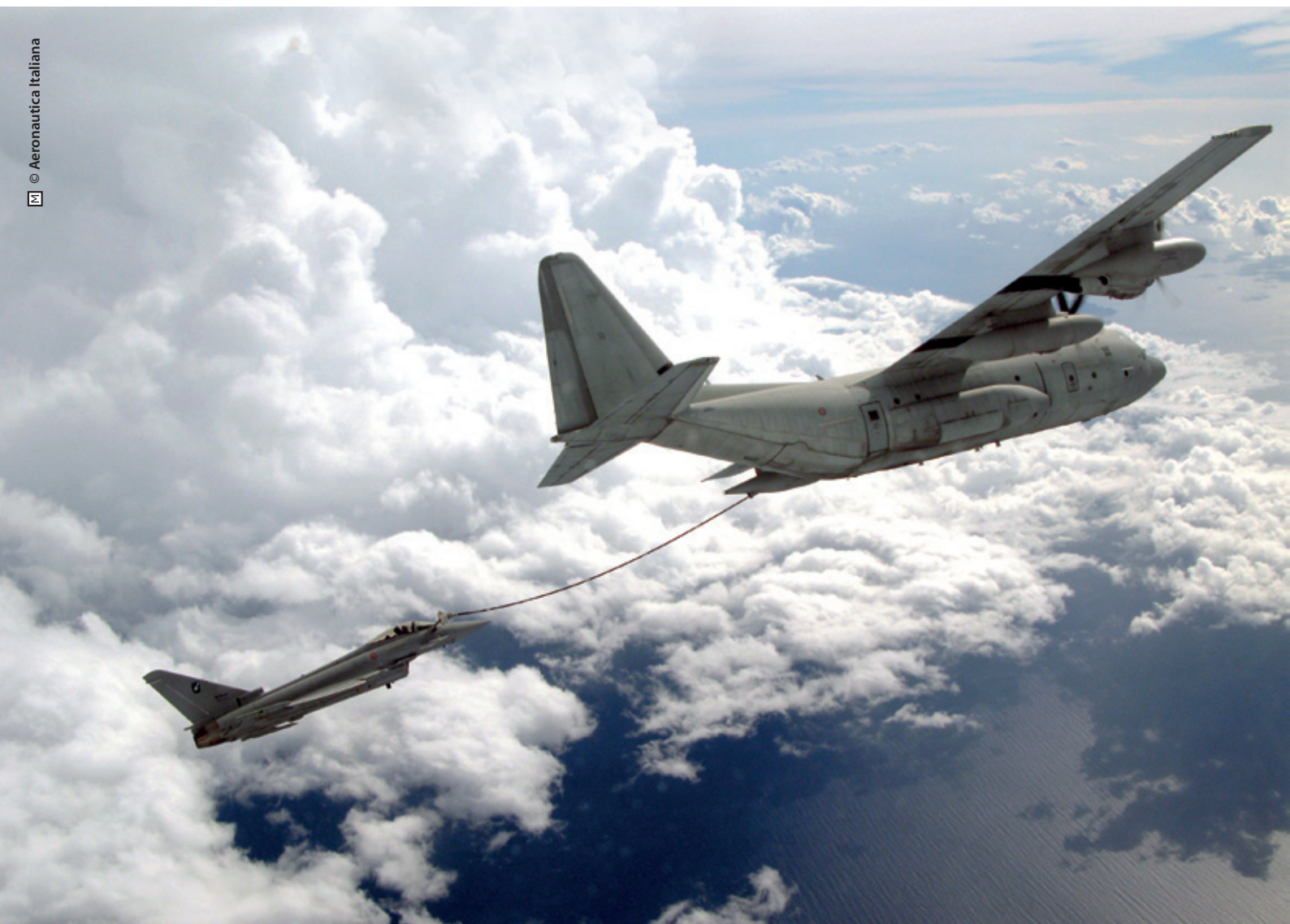
KC-130J refuelling an Italian EF-2000 Typhoon.

8.9.2 Recommendation: The National Annexes within ATP-56 (B) provide a means by which NATO Nations can publish their AAR clearance standards. If a common clearance and currency mechanism can be developed for nations to share a standardised process, greater interoperability would exist amongst nations.