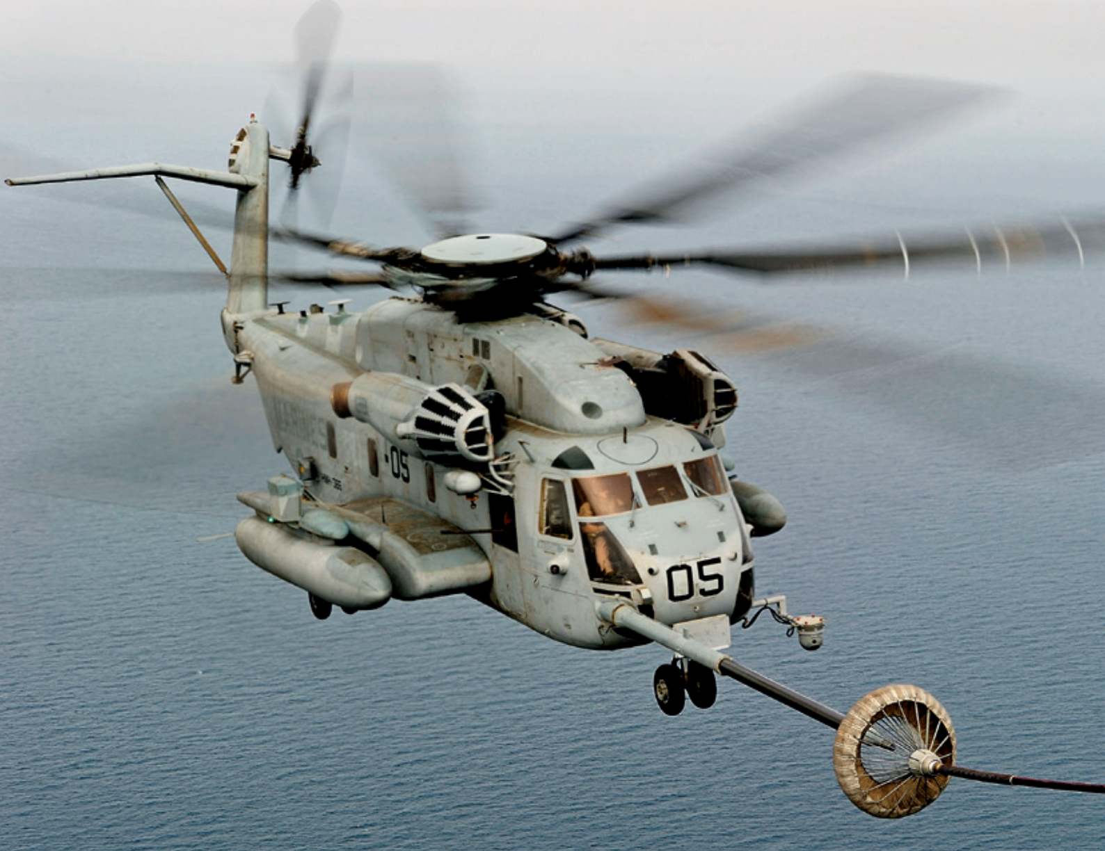
A US Marine Corps CH-53E Super Stallion helicopter makes contact with a C-130 during an in-flight refuelling off the coast of Djibouti 28 Jul 10.

that the total, number of tankers could be smaller than today. It is anticipated that fewer 'KC-X' tankers will enter service than the retiring KC-135 fleet, and despite the KC-X being a more capable platform, it is possible that the overall AAR output may be reduced. The USAF is expected to award a contract for a KC-135 replacement tanker in 2011. The RAND Analysis of Alternatives (AoA) Executive Summary provides a useful discussion of requirements and recapitalisation strategy. 1