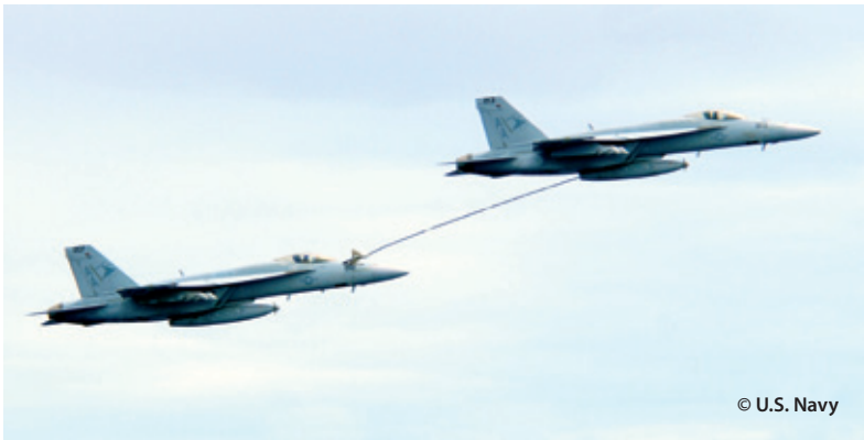
Buddy-buddy refuelling between F/A-18E Super Hornets.

Quantity in NATO Nations US: Unknown number of kits (USN/USMC)