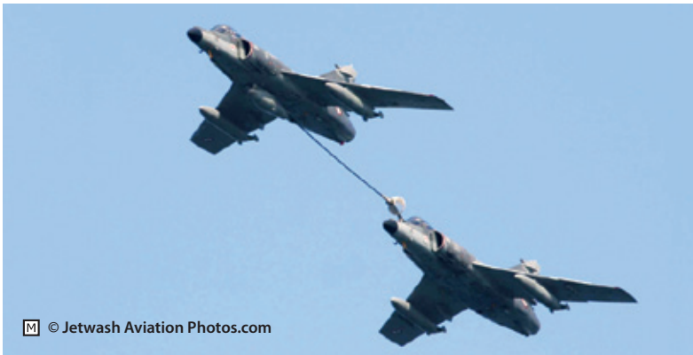
French Super Etendard making buddy-buddy refuelling.