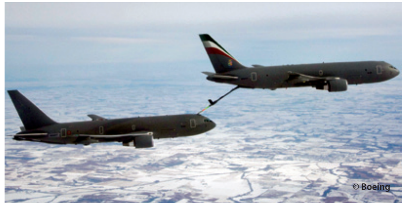
Italian Air Force Boeing KC-767 Tankers.