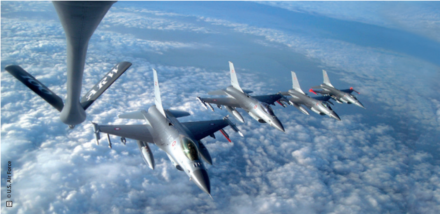
Four Royal Danish Air Force F-16s in formation behind a 100th ARW KC-135 over Denmark 08 Dec 09.