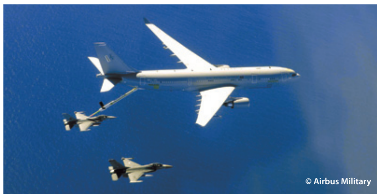
RAAF KC-30A refuelling Portuguese F-16s.