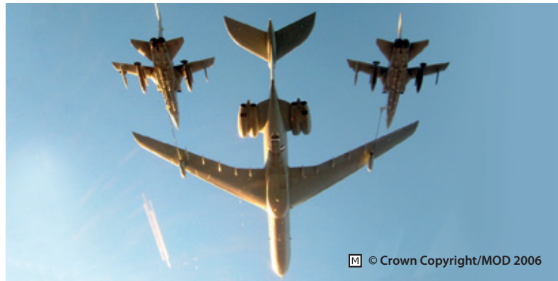
RAF VC-10 refuelling two F35s.