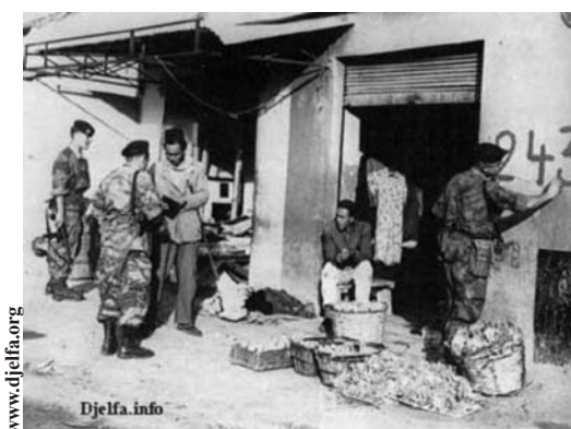
Setting up the population control. Soldiers conduct a census of inhabitants and number buildings.

Trinquier’s book, Modern Warfare , bears the stamp of his experience in Algeria, and to a lesser extent, in Indochina. Subsequently his references in term of rebellion model are limited.