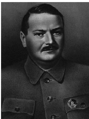
Andreï Jdanov, Leader of the Kominform which replaced the Komintern after World War II. This organization was responsible for coordinating the actions of the different national communist parties.

The main difference between the two authors lies in their analysis of the insurgency origins and of the means needed in order to defeat the insurgents.