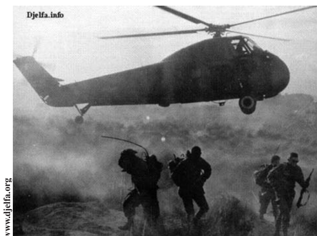
Infantrymen carrying out a heliborne operation

The 3 rd phase aims at destroying the refuge areas of the guerilla to definitely crush the insurgency. Because of the strength of the enemy in these areas, a sufficient number of elite forces should be available. The course of action is almost the same as the one used in phase 2. However, as refuge areas being quite difficult to access for regular forces 9 , the use of rotary- and fixed-wing aircraft is essential 10 .