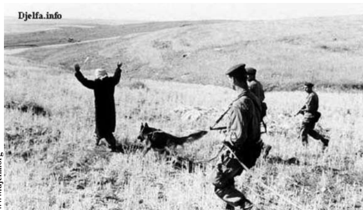
Combing inhabited rural areas. Soldiers arrest or assemble the population in unassigned areas.

First, the police forces implement in the villages the same measures than in the cities (cordoning-off, control of populations and movements, general interrogation and breaking up of the insurgent organization). However they also proceed with assembling the population within the fortified villages before protecting and controlling it. Finally the armed forces make sure that the insurgency cannot resupply in the countryside (by destroying buildings and moving food stocks to the cities, where they will be protected and controlled).