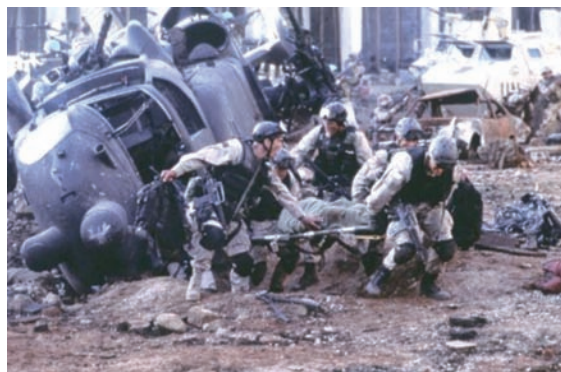
Black Hawk Down