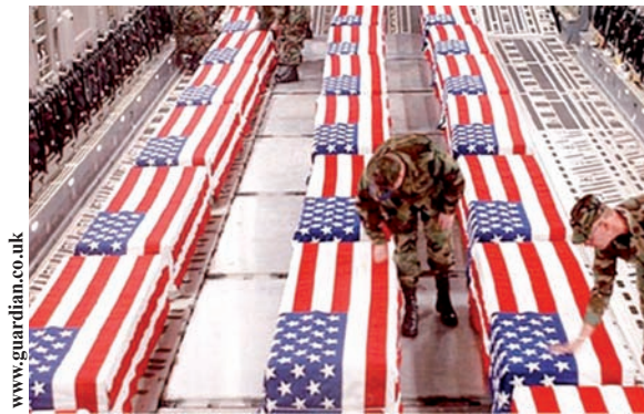
Coffins of U.S. soldiers fallen in Iraq.

Since he cannot defeat a conventional army during a pitched battle, the insurgent should wear out his opponent’s will to make him withdraw. To this end, he should trust his own capability of inflicting durable losses on the enemy, while hoping that the cumulated dead and wounded will finally exhaust the counterinsurgent. Jihadist fighters understood well the advantage they could take from loathing for blood expressed by Western public opinions. Therefore they first targeted contingents of the “weakest links” of the Coalition and hope to force these governments to withdraw their forces. However, none of these countries has still proceeded to a complete withdrawal from Afghanistan. Moreover, deeply shaken by the Sept 11 (2001) terrorist attacks, U.S. opinion is much more prepared today than in the past to accept losses and to make a sustainable war effort.