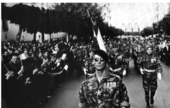
The Battle of Algiers