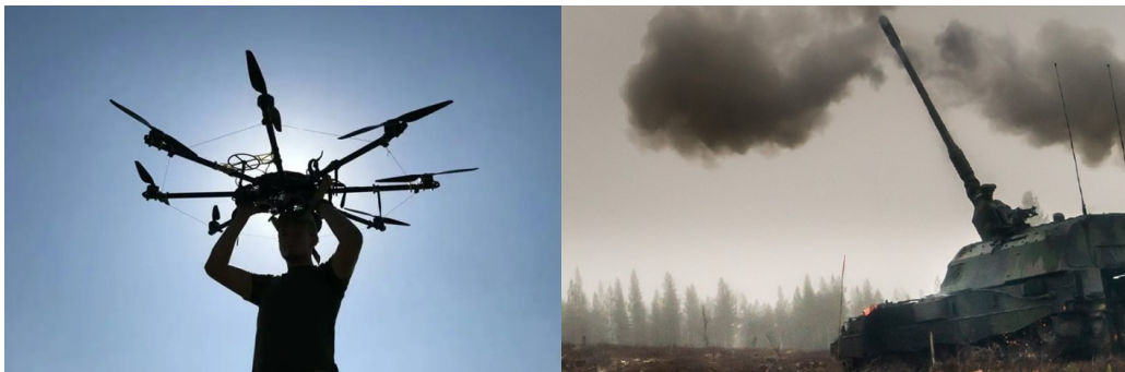
Left: New Scientist: Drone pilots defending Ukraine ( https://www.newscientist.com/article/2307922-meet-the-amateur-drone-pilots-defending-ukraines-border-with-russia/ ). Right: HCSS ( https://hcss.nl/report/lessons-from-land-warfare-one-year-of-war-in-ukraine/ )

The final report in the JALLC's 2023 Ukraine series was completed in December and contains a number of observations extracted from publications provided by a range of sources including from NATO Nations, NATO HQs, and again, from open-source material.