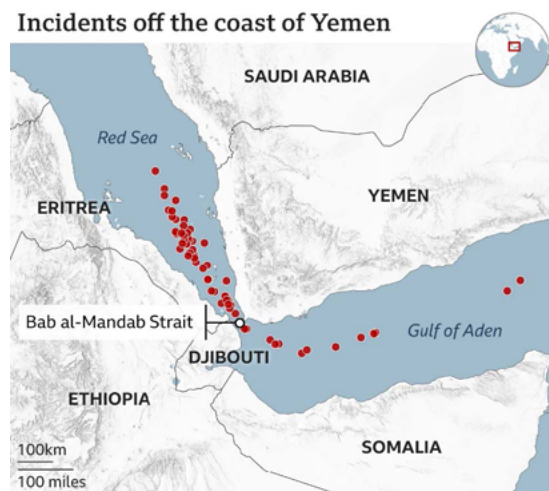
Figure 3: Yemeni Coast Incidents https://www.bbc.com/news/worldmiddle-east-68363692

After the Hamas-led attack on Israel on 7 October 2023, which sparked the Israel-Hamas war 8 , numerous Iran-backed militant groups throughout the Middle East, including the Houthis, voiced solidarity with the Palestinians and issued threats against Israel. Houthi leaders specifically cautioned the U.S. against intervening on behalf of Israel, warning of retaliatory drone and missile strikes in response. The Houthis actually carried out several attacks on commercial ships, once again the ongoing conflict in Yemen threatens the maritime security in the Gulf of Aden.